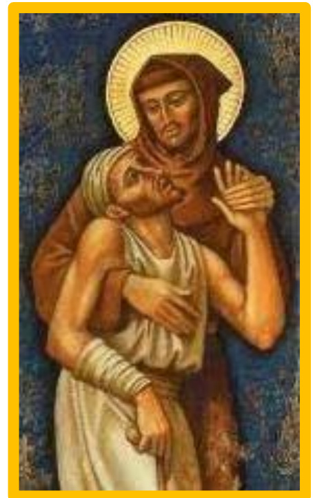
St. Francis Kisses the Leper

Will you let the blinded see If I but call your name? Will you set the pris'ners free And never be the same? Will you kiss the leper clean, And do such as this unseen, And admit to what I mean in you And you in me?