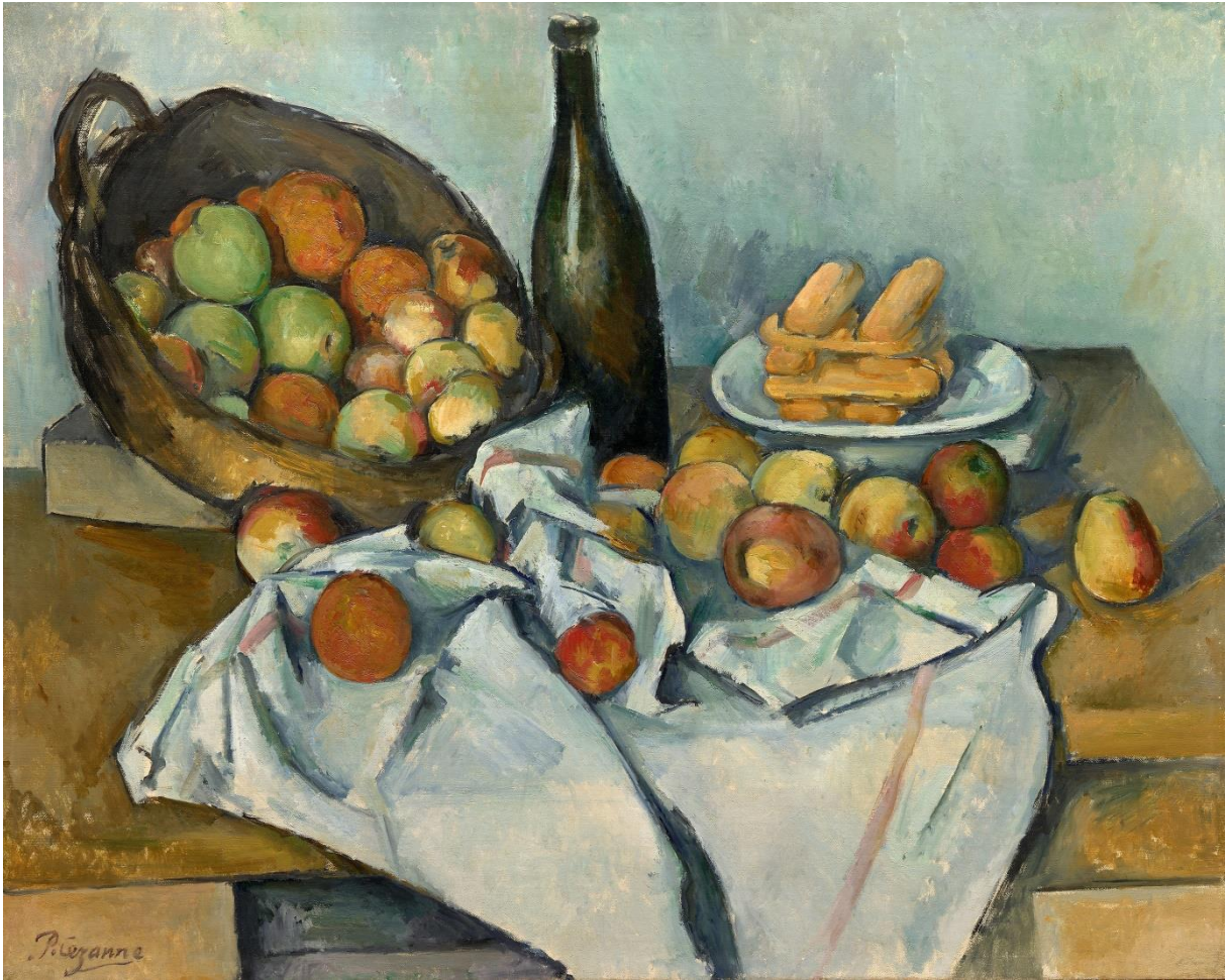
The Basket of Apples ~ Paul Cézanne