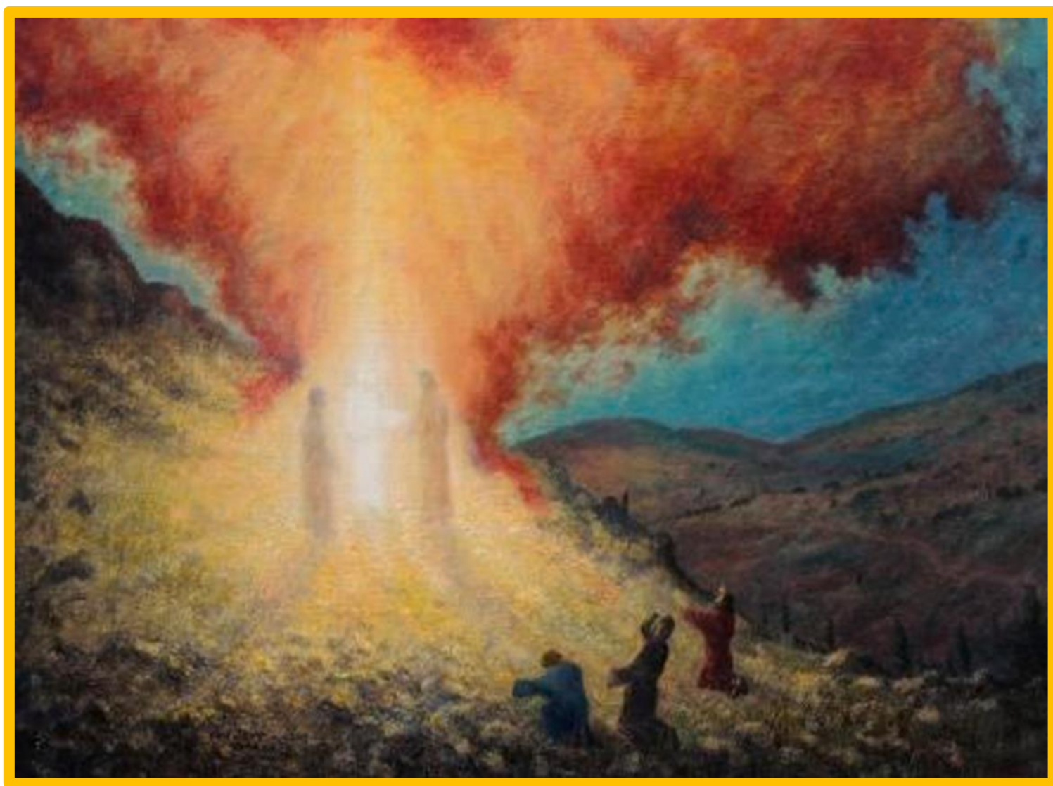
The Transfiguration of Christ ~ Earl Mott