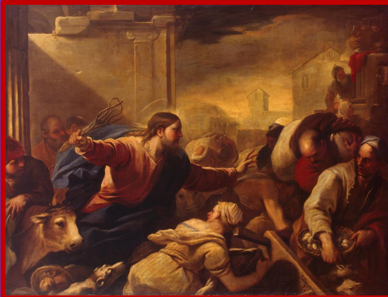
Expulsion of the Money-Changeers from the Temple ~ Luca Giordano