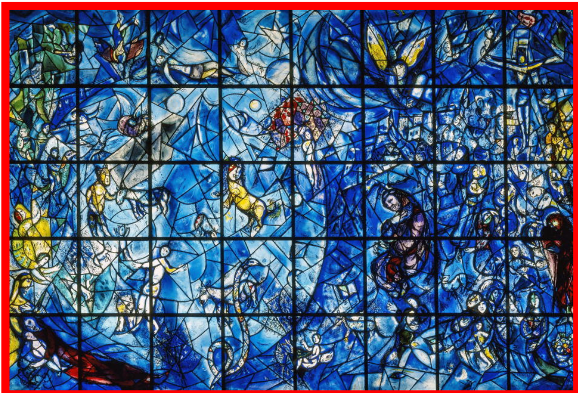
The United Nation's Peace Window, New York Marc Chagall, 1964