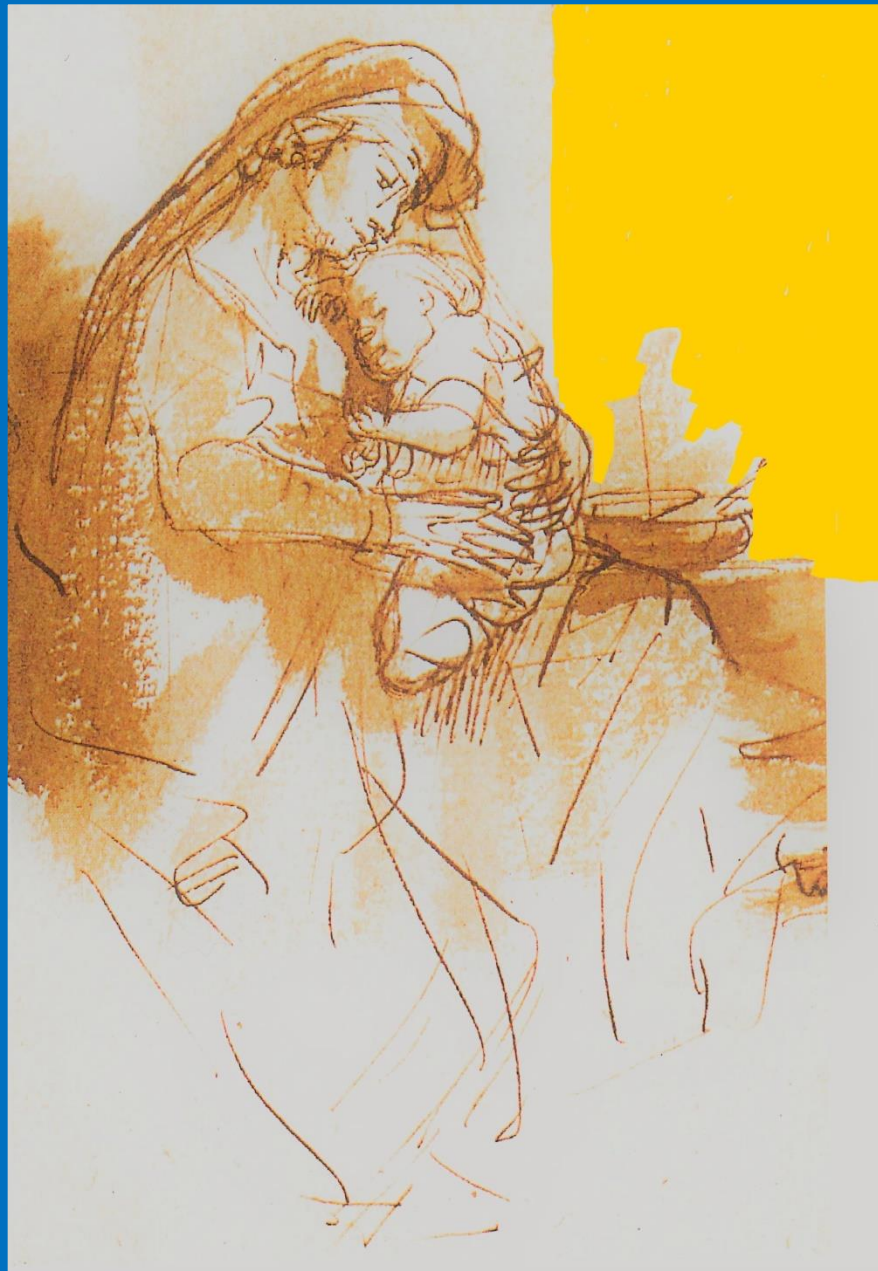
Mary with the child by a window ~ Rembrandt van Rijn