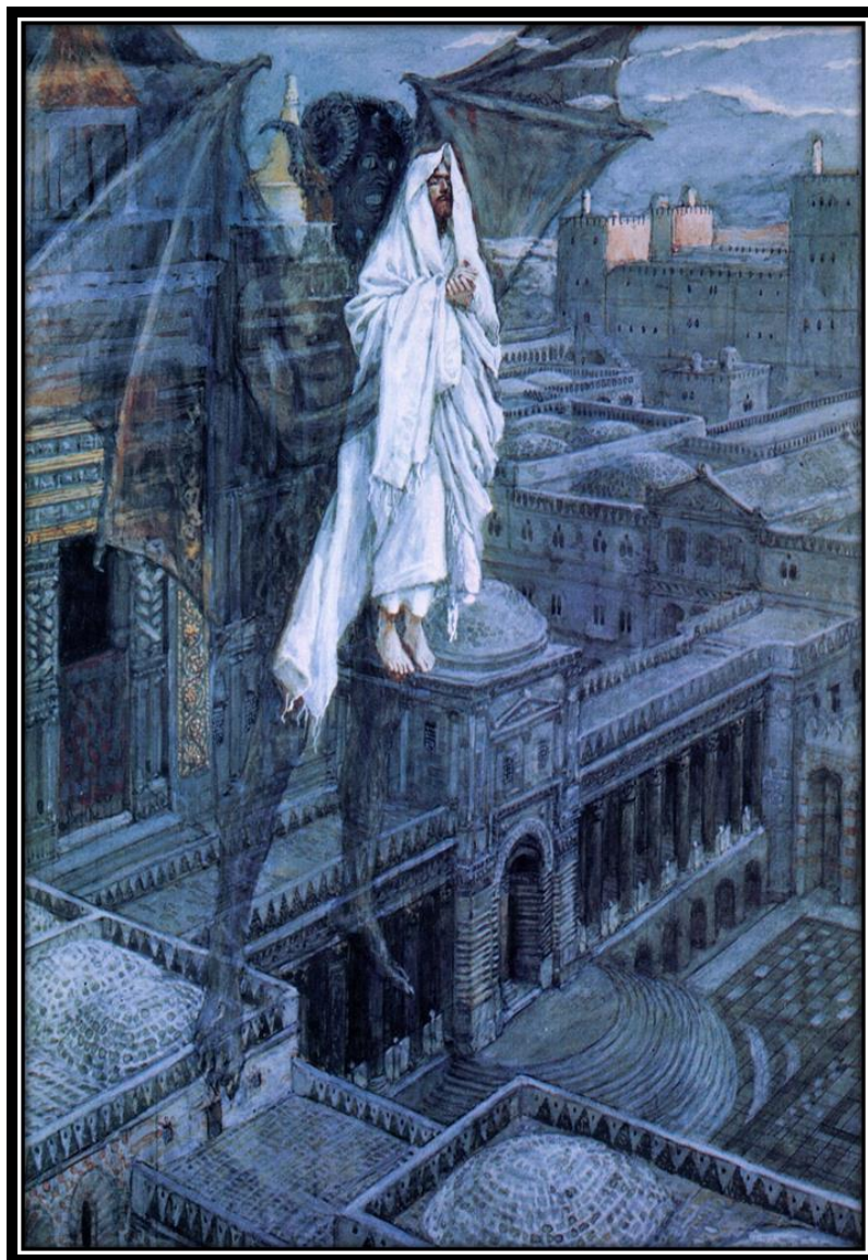
Satan Tried To Tempt Jesus ~ James Tissot